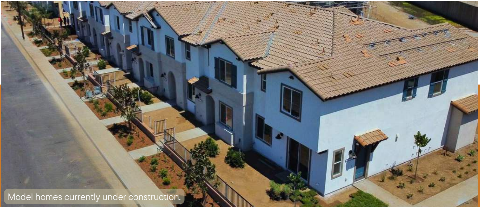
Model homes currently under construction.